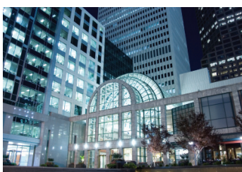
Manufacturing & Industrial